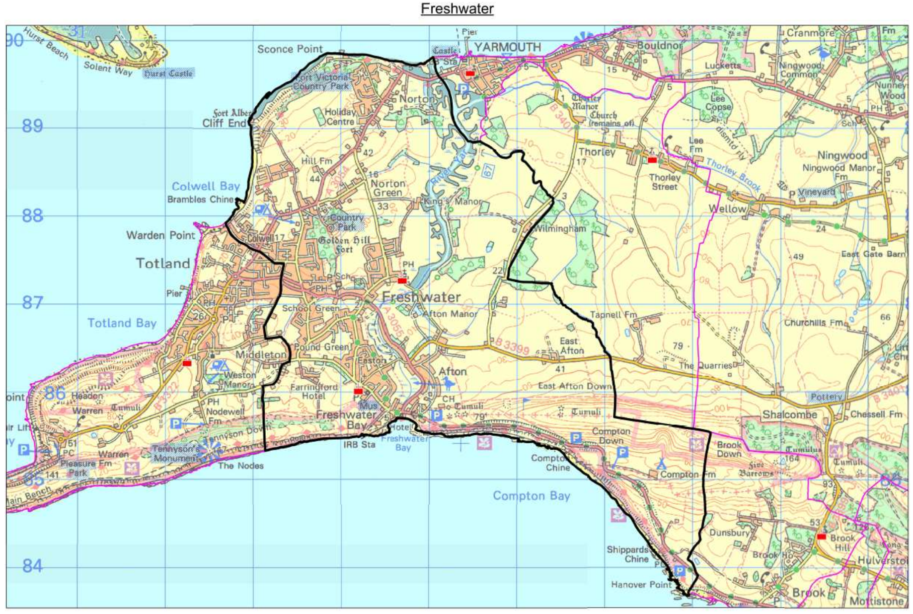
© Digital Map by Diocese of Portsmouth. Crown Copyright. Ordnance Survey licence number 10019918