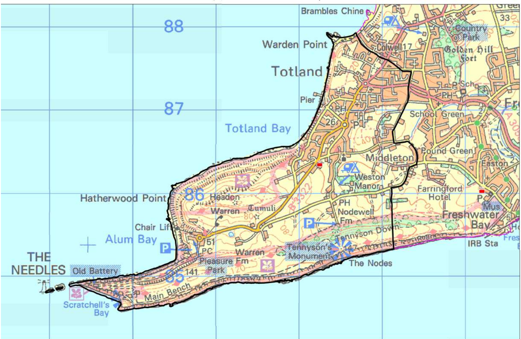
Totland Bay (with detached areas 1 & 2)

Digital Map by Diocese of Portsmouth. Crown Copyright. Ordnance Survey licence number 10019918