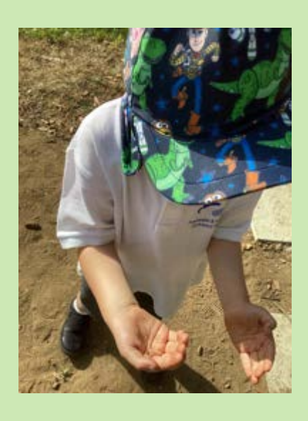
Exciting developments are going on in both our school gardens. Watch out for gardening opportunities coming up and come along and get involved.