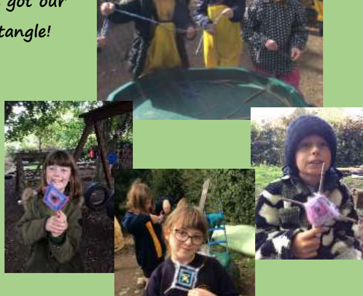
What do you think of our handiwork?